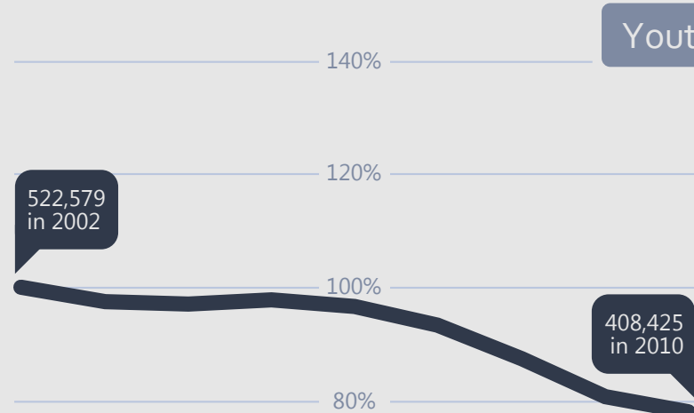
Youth in Foster Care

But in Indiana, children in foster care have increased by 44.8%.